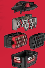
REDLITHIUM™-ION HIGH OUTPUT